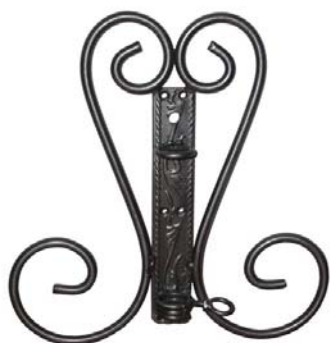
1 pc – Holder